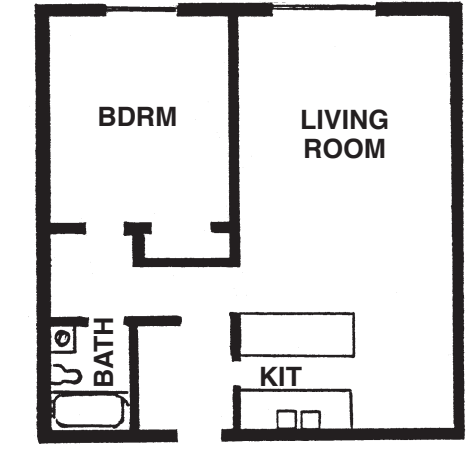
FLOOR PLAN C 612 SQ. FT.

Spacious 1 & 2 Bedrooms Free Air Conditioning Free Heat Free Electric Gas Stoves Pool & Playground Area